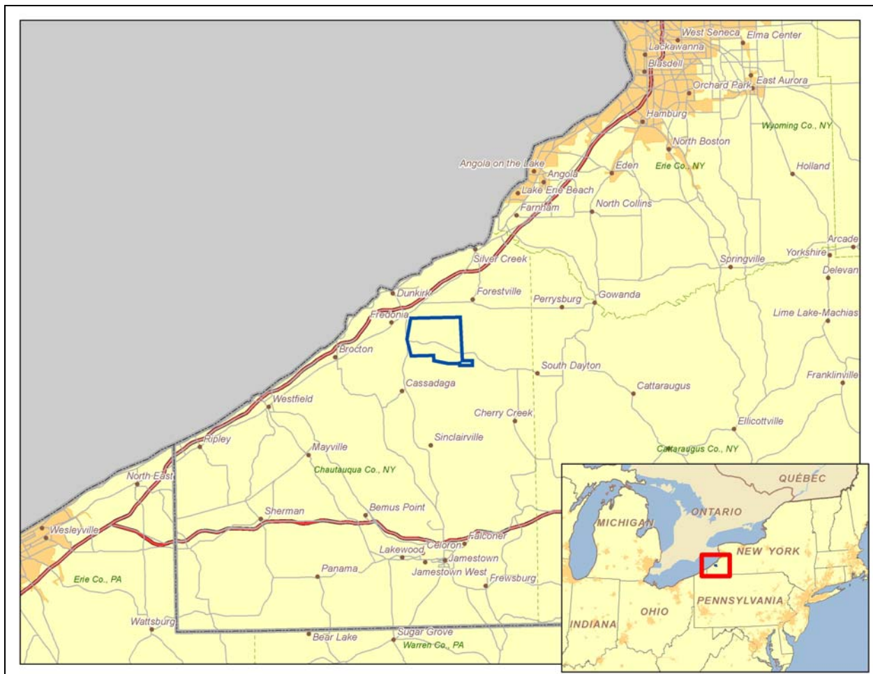
Figure 1: Wind Farm Project Area and Local Communities

The proposed wind energy project area and local communities are depicted in Figure 1, below.